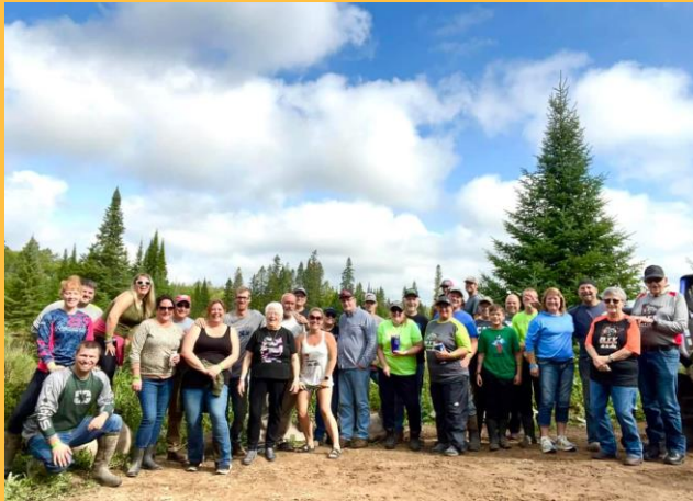
Photo: One of the many groups that stopped at the selfie station on the Emily Blind Lake Trail during the guided rides offered at the 2022 Ride & Rally.