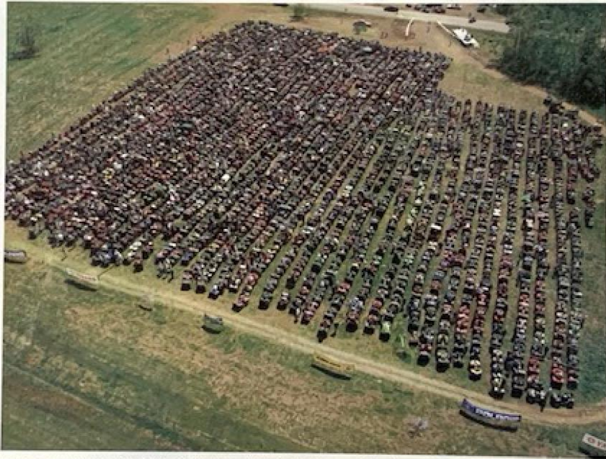
Last June, more than 1,600 ATV riders get ready to break the record for the world's longest ATV parade.

To view the official Guinness Record, check out www.guinnessworldrecords.com . Click on Search the Site and enter "The Largest Parade of Quadbikes (ATVs)" in the search box. OR