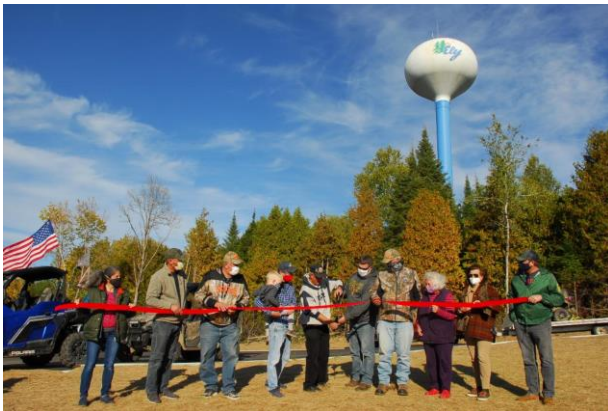
Ribbon-cutting ceremony for a new trailhead in Ely