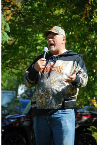
State Senator Tom Bakk