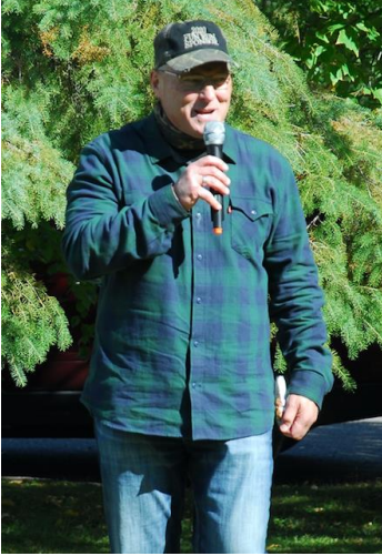
Congressman Pete Stauber