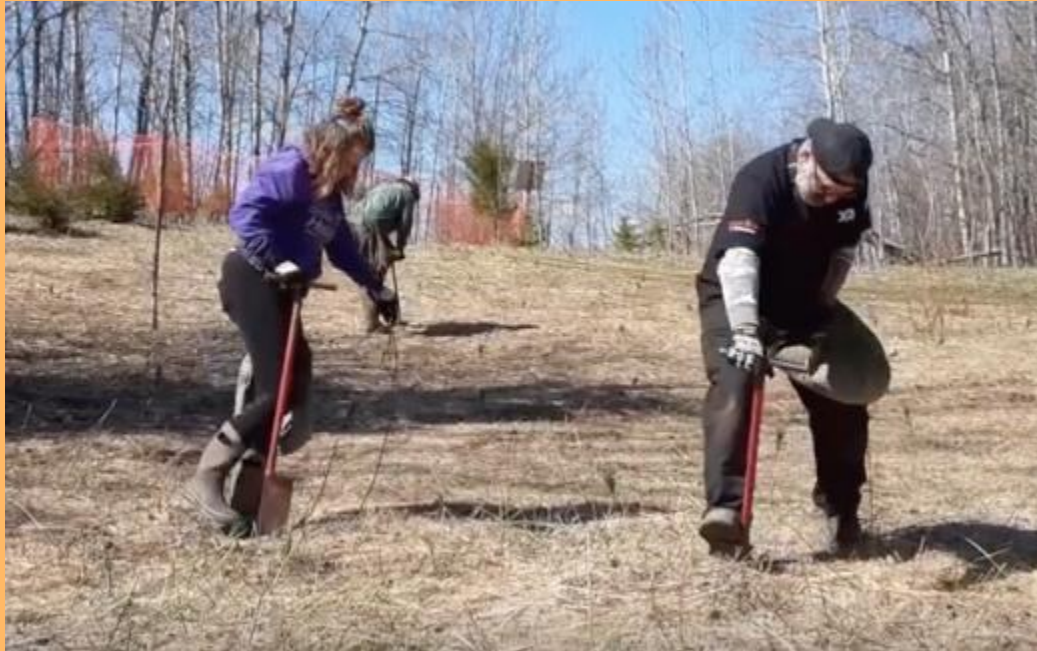
Members of the Carlton County Riders were among volunteers helping its County Commissioners plant 1,000 trees at the site of an old landfill near the Soo Pits Trail in Moose Lake.