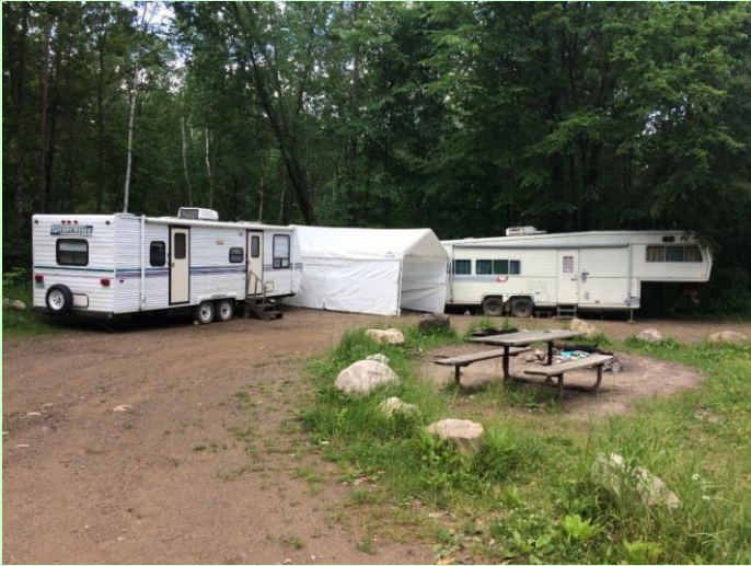
Campsite with amenities? Not allowed.

But camping in sites with tables or fire rings, or within a mile of a developed State Forest campground (which are still closed), is not allowed.